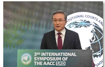
▲ Namseok Yoo, President of the Constitutional Court of Korea, delivering the Opening Remarks.

From 10 to 11 November 2021, the AACC SRD held its 3 rd International Symposium in online format. In line with the AACC SRD's 2021 book project, this conference at Justice-level discussed the topic of constitutional rights protection in Asia, focusing on the experience of AACC member institutions. The event was divided into three main sessions, respectively discussing 1) common values and diverse aspects of constitutional rights in Asia , 2) new challenges to constitutional rights , and 3) constitutional adjudication and the universality of human rights . This event was attended by 40 participants, consisting of Justices and special guests. The presentation materials of the speakers are available in the "Archive" section of the AACC SRD's online database.